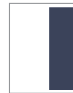
1/2 Long Vertical